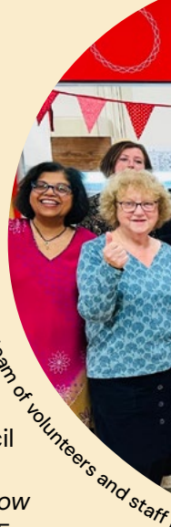
The team of volunteers and staff